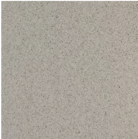
Light (Cefalu) Grey