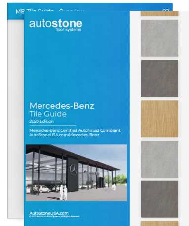
Mercedes-Benz Tile Guide

We reduce the risk of not having the materials you need, when you need them!