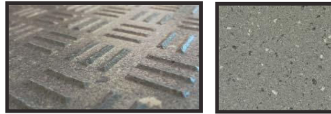
Finish: LINE.BRIGHT - R-12/A+B+C