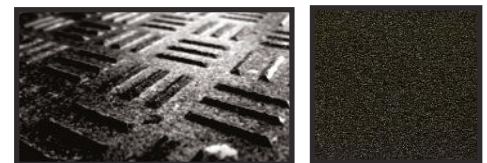
Finish: LINE.BRIGHT - R-12/A+B+C