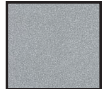
18" x 18" Polished