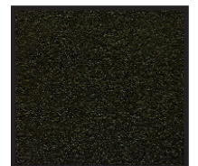
12" x 12" R-Shop Textured