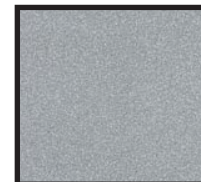
18" x 18" Bright