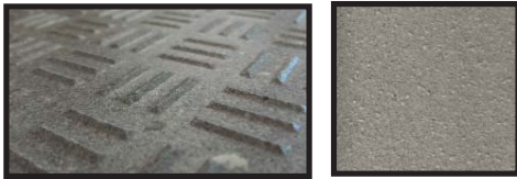
Finish: LINE.BRIGHT - R-12/A+B+C