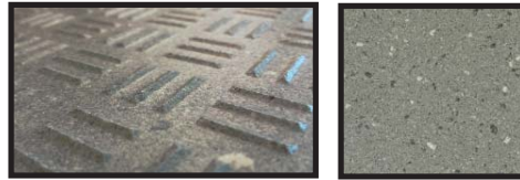
Finish: LINE.BRIGHT - R-12/A+B+C